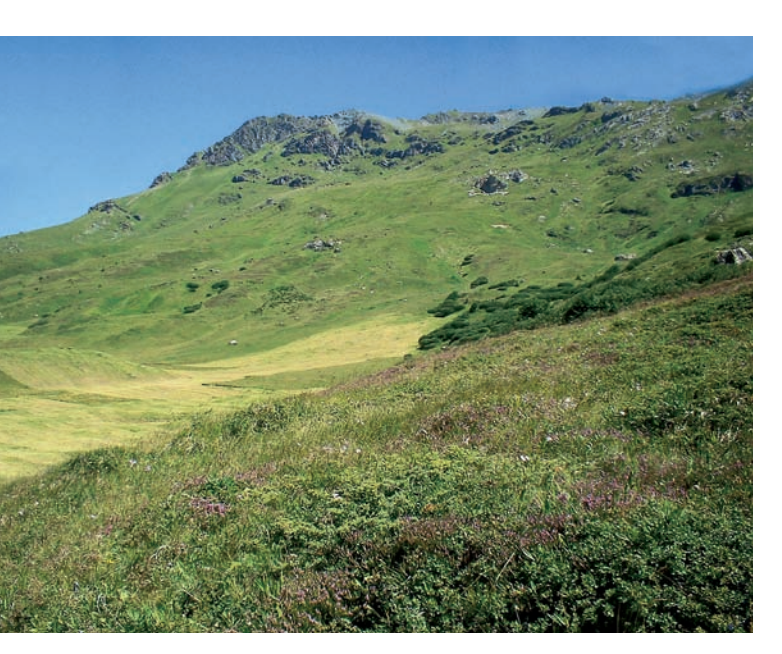
Fig. 1: Typical landscape on the Alp Flix consisting of hay-field, meadow and heather.

The floral richness of the Alpine meadows gave the impression that insects could be found in the same amounts and diversity. Perhaps in the preceding months this could have been the case, but during my stay most of the bright flowers were unattended by arthropod visitors. The worn wings of many coll-