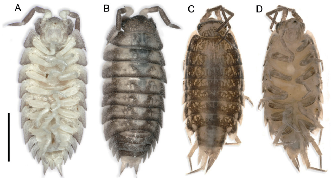
Fig. 2. Images of Nagurus cristatus in ventral (A) and dorsal (B) view; and Chaetophiloscia cellaria in dorsal (C) and ventral (D) view. Scale bars: 1 mm.

animals. This has also contributed to its dispersal. In Europe, the species can be found in greenhouses of many countries: Austria, Belgium, Czech Republic, Denmark, France, Germany, Hungary, Ireland, the Netherlands, Norway, Poland, United Kingdom, and Switzerland (Dollfus, 1896; Foster, 1911; Pack-Beresford & Foster, 1913; Meinertz, 1934, 1936; Holthuis, 1945, 1948, 1956; Polk, 1959; Jędryczkowski, 1979, 1981; Olsen, 1995; Berg, 1997; Wouters et al. , 2000; Korsós et al. , 2002; Soesbergen, 2003; Farkas, 2007; Berg et al. , 2008; Vilisics & Hornung, 2009; Cochard et al. , 2010; Farkas & Vilisics, 2013; Gregory, 2009, 2014; Séchet & Noël, 2015; De Smedt et al. , 2017, 2018; Jaskul et al. , 2019).