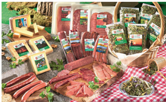
FIGURE 4 A selection of labeled products sold in supermarket chains in Switzerland.