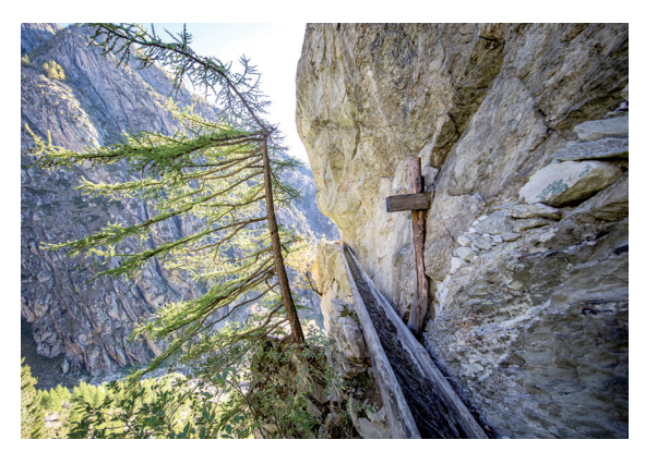
Figure 5 - Suone Wyssa.

glacier water. This results in a conflict of goals: the technical simplifications, especially the operation of sprinkler systems, make water use and work more efficient. At the same time, a valuable form of cooperation, a traditional craft and knowledge system and landscape qualities are lost – and with them a part of the cultural heritage and regional identity (Bär & Liechti 2020).