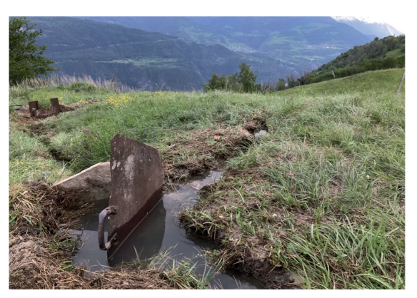
Figure 6 – Traditional irrigation.

824 km² World Heritage area 1,629 km² World Heritage region 23 communities: 15 in the Upper Valais and 8 in the Bernese Oberland 9 peaks above 4,000 m a.s.l. Finsteraarhorn the highest at 4,273 m About 50 peaks are above 3,500 m About 350 km² are glaciated areas With a length of 20 km, the Great Aletsch glacier is the biggest and longest glacier of the Alps 88% are unproductive and vegetation-free areas