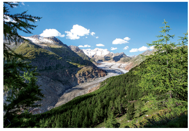
Figure 2 – The Grand Aletsch glacier.