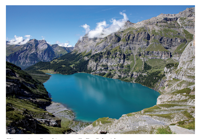
Figure 1 – Oeschinensee.

This article describes the contribution of the SAJA management centre to the preservation and restoration of an important cultural-history element of the cultural landscape, the traditional irrigation system, and the project Preservation of the Traditional Irrigation in the Upper Valais . The explanation of the traditional irrigation system is based on Einblicke-Ausblicke , a regular